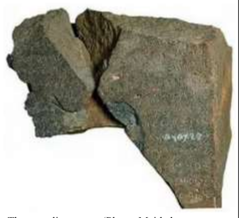
The revealing stone.

Archaeologists have spent seven years on the site, discovering unprecedented evidence of the nature of King David's reign. "The ruins are the best example to date of the uncovered fortress city of King David," Garfinkel and Ganor say. "This is indisputable proof of the existence of a central authority in Judah during the time of King David."