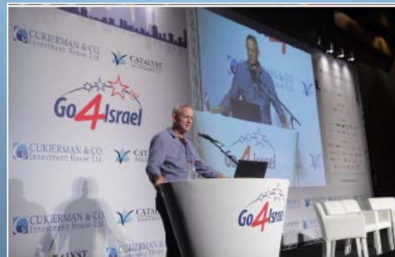
IDF Chief of Staff Mr. Gantz