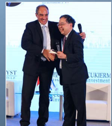
Ronnie C. Chan, Chairman – Hang Lung Properties Ltd.