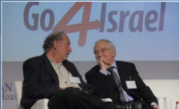
Technology investor and entrepreneur Mr. Israel Yossi Vardi