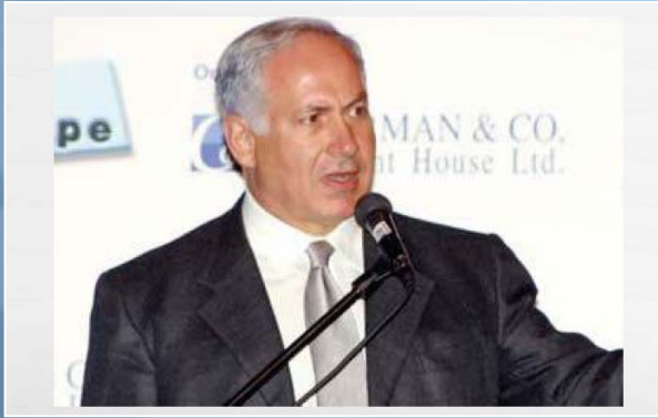
Israeli Prime Minister Benjamin Netanyahu