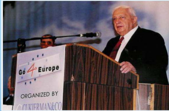
Israeli Prime Minister Ariel Sharon