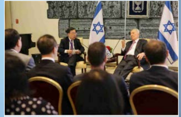
Israeli President Shimon Peres